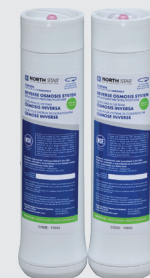
Pre & Post Filter NSROF