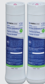
Pre & Post Filter NSROF